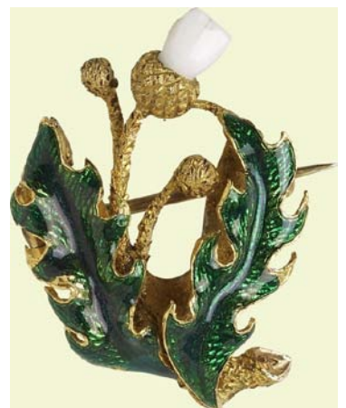
Fig. 3 Unknown maker, Thistle brooch, 1847 Enamelled gold set with an infant tooth, 2.7 × 2.1 cm Royal Collection, RCIN 13517