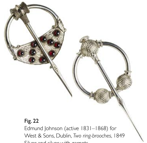
Fig. 22 Edmund Johnson (active 1831–1868) for West & Sons, Dublin, Two ring-brooches , 1849 Silver and silver with garnets, 7.2 x 13.9cm and 7.2 x 13.6cm respectively Royal Collection, RCIN 12457, RCIN 4833

Some of the Queen's personal jewels are not particularly feminine, the 1840 turquoise eagle for the trainbearers at her marriage, for example (fig. 25), made by Charles du Vé of London, and the gem-set Crimean trophy of 1855 (fig. 26), made by John Linnet and given at Christmas, 1855, both designed by Albert. The German spread eagle, pavé-set with turquoises for true love, has a ruby eye (for passion), a diamond-set beak (for eternity), and holds pearls (for beauty) in its claws. 34 The Queen presented the train-bearers with their brooches in dark blue velvet cases after the wedding ceremony. At Woburn Abbey and Hatfield they remain with the