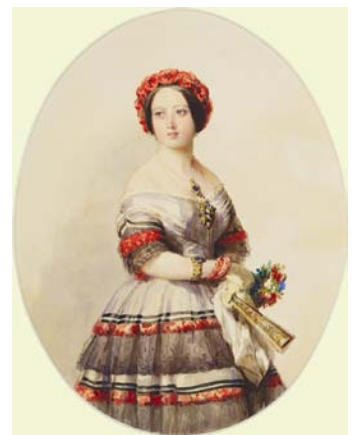
Fig. 1 Franz Xaver Winterhalter (1805–73), Queen Victoria , 1847 Watercolour, oval 30 x 23.5cm Royal Collection, RL 17968

Queen Victoria's fashion sense has been widely derided. In fact she was very interested in dress and jewels – her own largely in relation to Albert's preferences