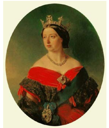
Fig. 2 Franz Xaver Winterhalter (1805–73), Queen Victoria, 1856 Oil on canvas, 88.6 × 72.2cm Royal Collection, RCIN 406698

Every piece had associations; this could even descend to the setting of infant teeth. An enamelled gold thistle brooch incorporates Princess Victoria's first tooth, which she shed in Scotland in 1847 (fig. 3). A pendant and earrings in the form of fuchsias, supplied by the Crown Jeweller in 1864, are set with Princess Beatrice's milk teeth (fig. 4). The royal collection boasts a few other rare jewels set with infant teeth. 7