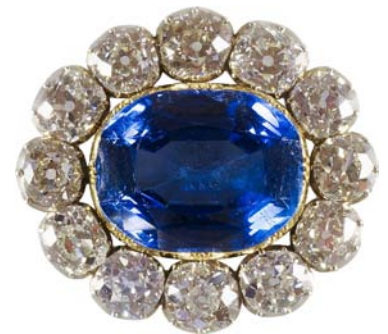
Fig. 14 English, Queen Victoria's Wedding Brooch , 1840 Sapphire, diamonds and gold, 3.7 x 4.1cm Royal Collection, RCIN 200193

Winterhalter's portrait of the Queen in wedding dress, lace and jewels, painted seven years later for the Prince Consort on the anniversary of their wedding, corrects this omission ( fig. 15 ): Albert's sapphire brooch is prominent on Victoria's lace collar. 17 The creamy-white silk-satin dress is in the Museum of London, while the magnificent