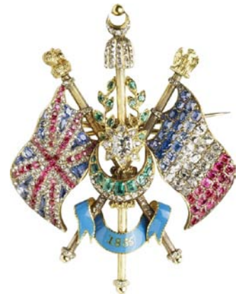
Fig. 26 John Linnet (active 1809–c.1855), 'Alliance flag' brooch, 1855 Silver; gold, rubies, sapphires, diamonds, emeralds and enamel, 5.8 x 4.5cm Applied label 'JL' for John Linnet, London, 1855 Royal Collection, RCIN 4804