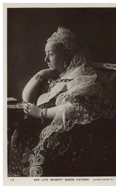
Fig. 6 (far left) Brian Edward Duppa (active 1832–53), Queen Victoria , 5 July 1854, 1889 Carbon print, 21.7 × 16.6 cm Royal Collection, RCIN 2906533