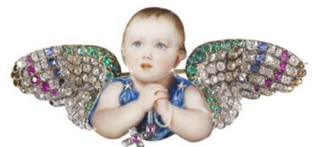
Fig. 21 Prince Albert (1819–61), designer; William Essex (1784–1869), after William Ross (1794–1860), miniaturist; unknown jeweller, Angel brooch , 1841 Enamel with wings pavé-set with diamonds, emeralds and rubies, 3.5 x 6.8cm Royal Collection, RCIN 4834