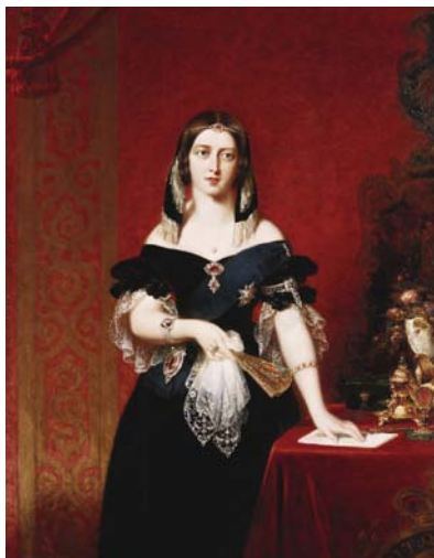
Fig. 17 (far left) John Partridge (1790–1872), Queen Victoria , 1840 Oil on canvas, 142.6 x 112.1cm Royal Collection, RCIN 403022