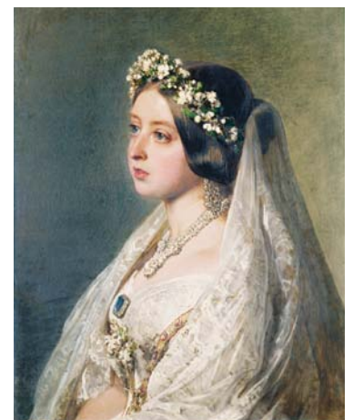
Fig. 15 Franz Xaver Winterhalter (1805–73), Queen Victoria in her Wedding Dress , 1847 Oil on canvas, 53.7 x 43.4cm Royal Collection, RCIN 400885