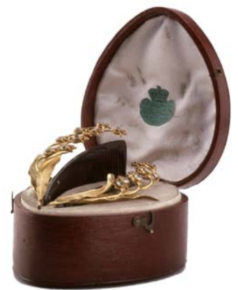
Fig. 9 Rundell, Bridge & Rundell, Lily-of-the-valley comb-mounts, c.1833–7 Tortoiseshell, gold, chrysoberyls and rubies, length 8cm London, British Museum, Hull Grundy Gift, HG Cat. 636