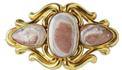
Fig. 31 Attributed to R. & S. Garrard, Two bracelets and brooch , 1841 (top); (centre); (bottom) Agates and gold, 18.0 x 1.5cm; (centre) Royal Collection, RCIN 12453 RCIN (centre); RCIN