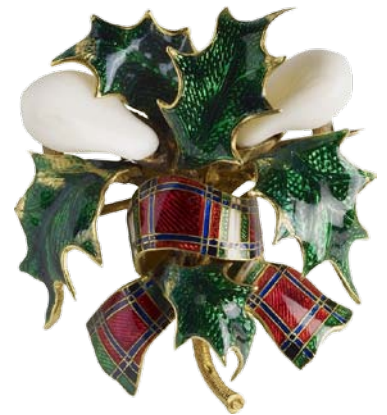
Fig. 30 R. & S. Garrard & Co., Holly brooch with Royal Stuart tartan ribbon , 1850 Enamelled gold set with stag's teeth, 2.0 x 3.7 x 4.0 cm Engraved on the reverse: 'Dee Sept. 11. 1850/From Albert May 24 1851' Royal Collection, RCIN 13516

Another pebble bracelet ( fig. 31 ) commemorates visits in 1842 to Windsor, Claremont and Brighton, where the royal family circulated before they had their much-loved homes at Osborne and Balmoral. In fact, although they liked Claremont, it was small and was not theirs, being the property of King Leopold of the Belgians, while Brighton, the soon-to-be-abandoned Pavilion, was much disliked by the Queen on account of the complete lack of privacy, while Prince Albert was frankly horrified by its exotic architecture. The brooch, engraved 'Rapley' and dated 1853 ( fig. 31 ) is 'composed of 3 pieces of pebble picked up at Bagshot', then the residence of the Queen's aunt, Princess Mary, Duchess of Gloucester. A beetle brooch made from the same pebble and a brooch with the initials 'PA' from another Bagshot pebble found by the Prince are also recorded in the archives. There must be a reason why Rapley in 1853 should mean so much to the Queen.