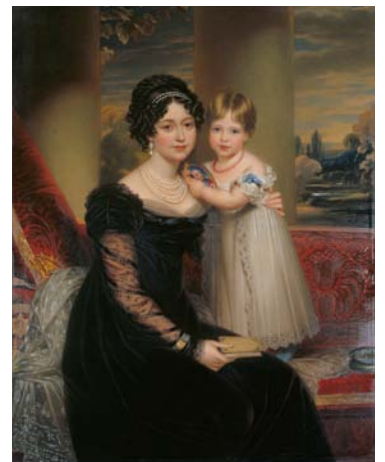
Fig. 20 Henry Bone (1755–1834), after Sir William Beechey (1753–1839), Duchess of Kent with the Infant Princess Alexandrina Victoria , c.1824 Enamel on copper, 26.4 x 21.5cm Royal collection, RCIN 404239