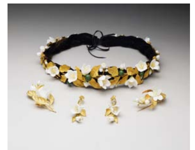
Fig. 12 Unknown maker; Orange-blossom parure , 1839–46 Porcelain, gold and enamel Royal Collection, RCIN 65305, 65306.1–2, 65307.1–2

The next event of great personal significance to the young Queen, her marriage to Prince Albert on 10 February 1840, produced more jewellery. As the example of the lily-of-the-valley shows, she was well versed in flower meanings. It was her choice of orange-blossom wreath and trimmings to her white dress for her marriage that made this almost a uniform for Victorian brides. The suite of orange-blossom jewellery given by Prince Albert over a number of years from the first sprig, an engagement gift accompanied by music of his own composition in 1839, has the obvious flower-language associations with the marriage ( fig. 12 ). The second brooch and the earrings were a Christmas present in 1845. The Queen's wedding wreath is perpetuated in the gold and porcelain circlet, the finest item in the suite, with blossoms studied from real, flowering sprigs, received in 1846. Victoria wrote in her Journal: 'My beloved one gave me such a lovely unexpected present ... the leaves are of frosted gold, the orange blossoms of white porcelain & 4 little green enamel oranges, meant to represent our children.' 14 The four oranges would not suffice for long; Princess Helena, their fifth child was born in the same year. Victoria always wore