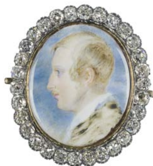
Fig. 18 Magdalena Dalton, née Ross (1801–74), Prince Albert , 1840 Watercolour on ivory; gold bracelet clasp surrounded by diamonds and with brooch attachment, 3.1 x 2.8cm Royal Collection, RCIN 4826