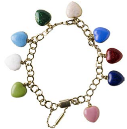
Fig. 5 Unknown maker; Bracelet, 1840–57 Gold with enamelled gold heart-shaped lockets, length 11 cm Royal Collection, RCIN 65293

The secluded and austere upbringing of the future Queen did not encourage wearing lavish jewellery. Conduct books of the period unanimously deplore jewellery for very young girls. Apart from some conspicuous exceptions in the form of precious gifts from William IV and Queen Adelaide acknowledging the inevitability of her succession, Victoria's much-treasured girlhood jewels consisted of modest, pretty, inexpensive trinkets like those of her contemporaries in 'polite' society. There are few pictures of her wearing jewellery as a girl, other than long top-and-drop earrings she