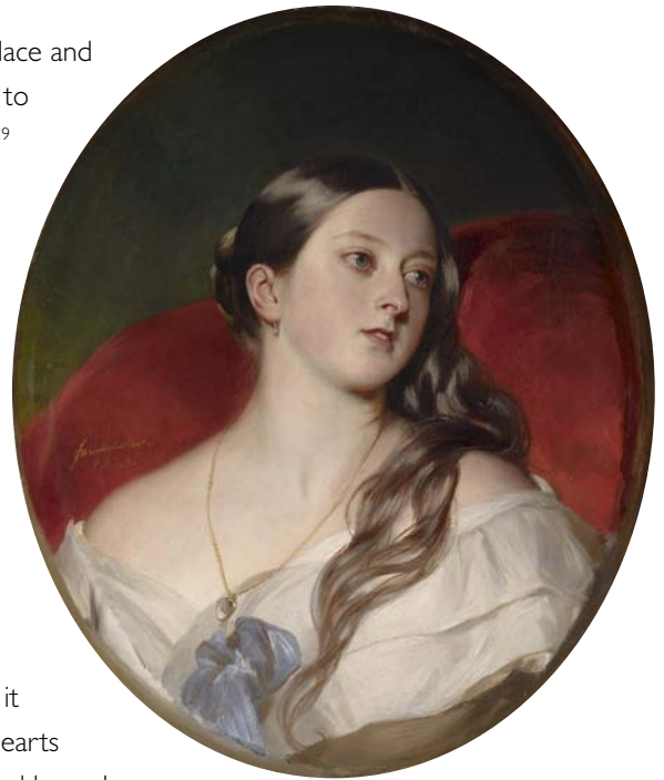
Fig. 16 Franz Xaver Winterhalter (1805–73), Queen Victoria , 1843 Oil on canvas, 64.8 x 53.4cm Royal Collection, RCIN 406010

Equally treasured were miniatures of the Prince set as jewels. John Partridge's portrait of the Queen, commissioned in 1840 as a Christmas present for Albert (fig. 17), reflects her jewel tastes at that time. With both a heart and a miniature, it is full of messages for Albert. The bracelet miniature is a version of William Ross's profile in enamel of the same year; considered by Victoria to be the best likeness of him (fig. 18). Partridge, rather a pedantic artist, painted the jewels with care and the heart-shaped locket appears to be rimmed with diamonds; it must be Queen Louise's gift. The other jewels include a ruby and diamond pendant brooch and a