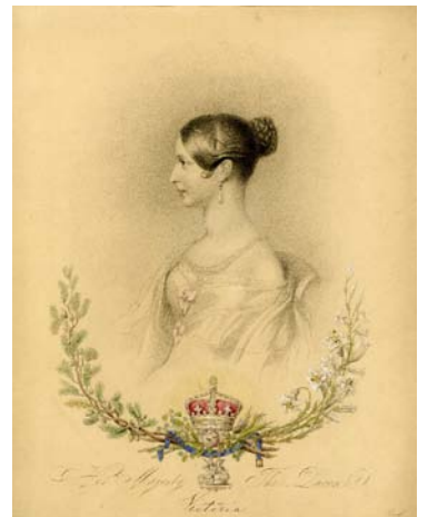
Fig. 8 Richard James Lane (1800–1872), Portrait of Princess Victoria , published by J. Bouvier, 1837 Stipple engraving printed in colours, 40.5 x 31.8cm London, British Museum, PD 1852,1009.608

Among its many other messages of purity and the return of spring, lily-of-the-valley stood for 'return of happiness' in the Victorian language of flowers. This became the birthday greeting, 'many happy returns'. Winterhalter's painting The First of May 1851 ( fig. 10 ) shows the Queen and Prince Albert with the infant Prince Arthur and the aged Duke of Wellington against a background of the Crystal Palace, housing the 1851 Great Exhibition of the Industry of All Nations . Prince Arthur offers a bouquet of lily-of-the-valley to the Duke. So, leaving aside its connection with opening day of the Great Exhibition on 1 May 1851, Winterhalter's subject is also birthdays in May. The Duke of Wellington and the one-year-old Prince Arthur were both born on 1 May, so the message conveyed by the nosegay presented to his godfather by Prince Arthur is 'happy birthday'. In more sombre circumstances, the flower stood for being reunited in death with a loved one and was associated with mourning, as Victoria well knew. She sent lilies-of-the-valley to be laid on the grave of General Grey, her private secretary. 13