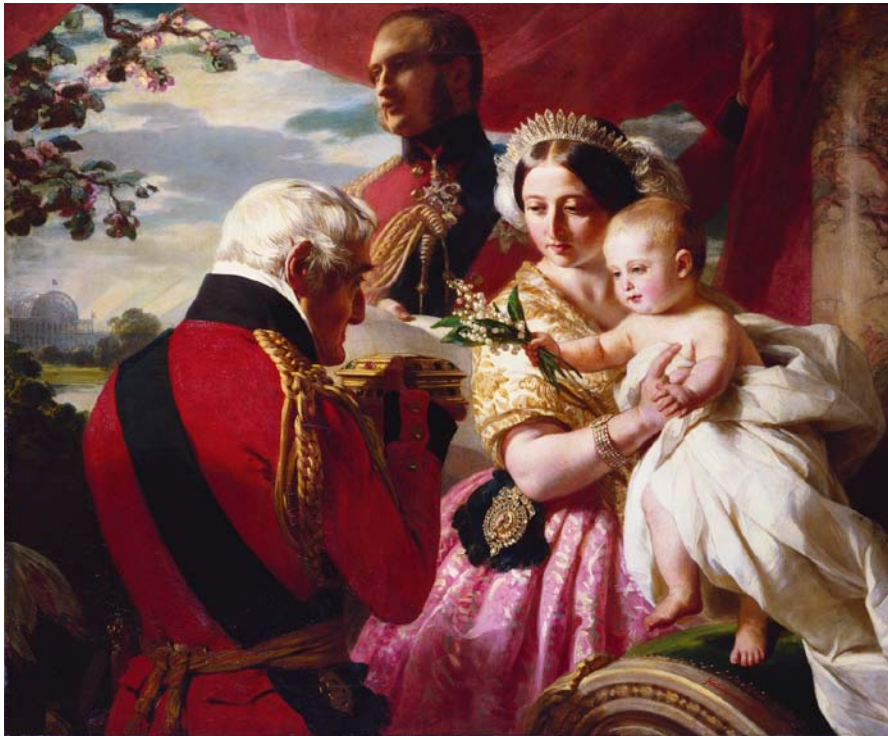
Fig. 10 Franz Xaver Winterhalter (1805–73), The First of May 1851 , 1851 Oil on canvas, 106.7 × 129.5cm Royal Collection, RCIN 406995