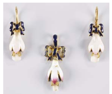
Fig. 4 R. & S. Garrard, Fuchsia pendant and earrings, 1864 Gold and enamel set with milk teeth Royal Collection, RCIN 52540–1