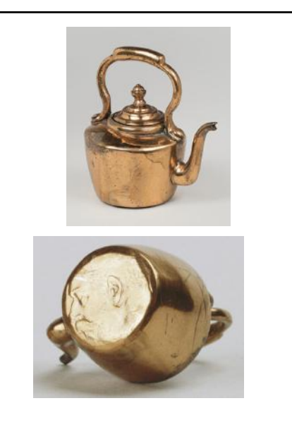
Items on display include a copper kettle made from a real coin, with the King's head still visible on the base.

Visitors will be able to compare the tiny items in the Waterloo Chamber display with their full-sized equivalents throughout the Castle's State Apartments, such as this miniature clock and full-sized mantel clock.