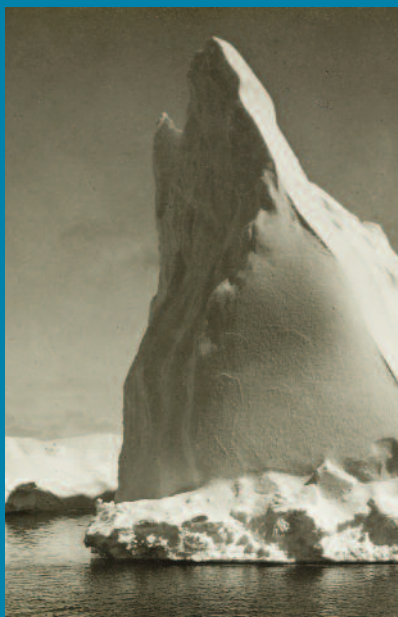
Right: Frank Hurley, A pinnacled glacier berg, 1915