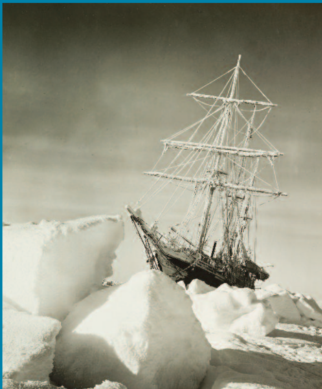
Above: Frank Hurley, The return of the sun after 92 days, 1915